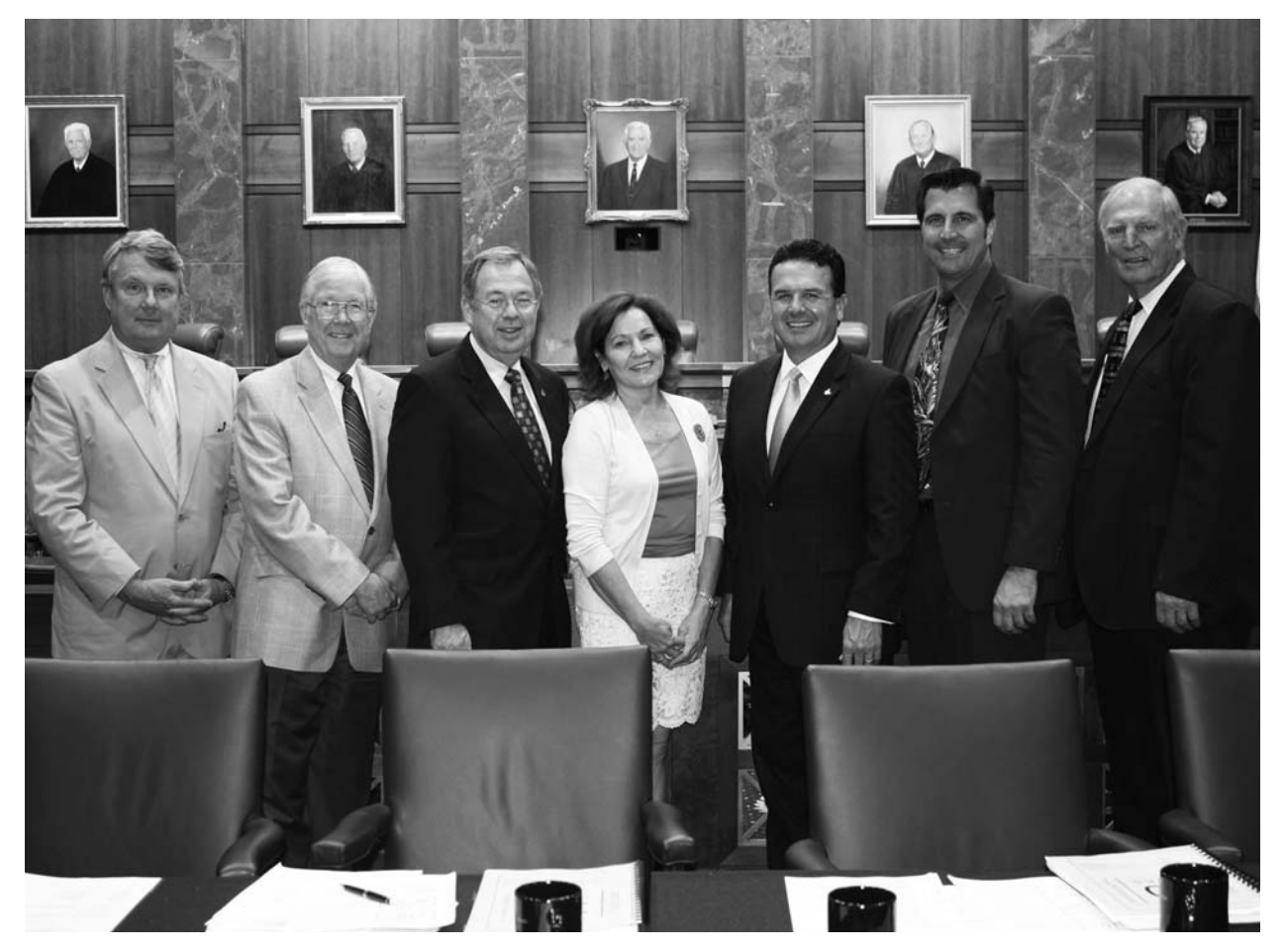
Members of the Texas Indigent Defense Commission Board

The keys to the Commission's success in helping counties meet their constitutional obligations to indigent defendants are three-fold: its respect for local control, its commitment to meaningful collaboration, and its focus on transparent operation.